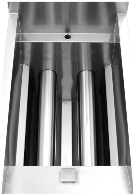
*304 Stainless steel tank.